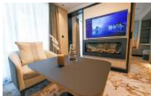
Premium Suite 49m 2 (528ft 2 ) | Sleeps 4

Premium suites feature a king size bed and separate living room with a soothing, flame-effect fireplace, a luxurious ensuite bathroom with separate bath tub and walk-in shower, a spacious walk-in wardrobe and a 12m 2 (129ft 2 ) private balcony.