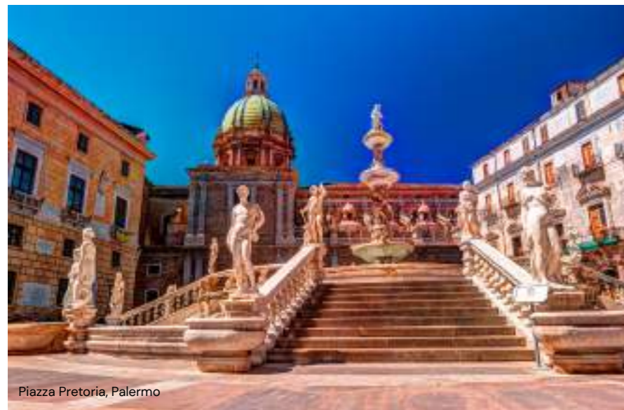
Piazza Pretoria, Palermo

📅 4-12 Sept 2023 📍 Palermo – Piraeus 📅 9 days 🏠 SH Diana