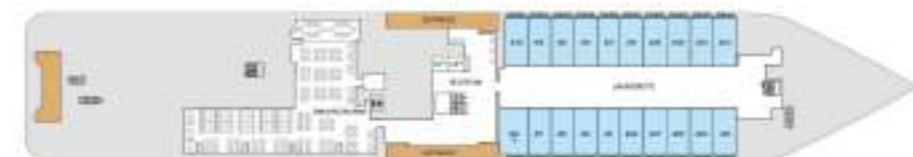
Deck 4 Swan Restaurant Reception Oceanview Staterooms Launderette