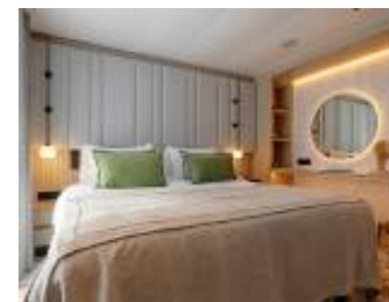
Junior Suite 35m 2 (377ft 2 ) | Sleeps 2/3

Suites feature a king size bed and separate living room with a soothing flame-effect fireplace, a luxurious ensuite bathroom with separate bath tub and walk-in shower and a 12m 2 (129ft 2 ) private balcony.