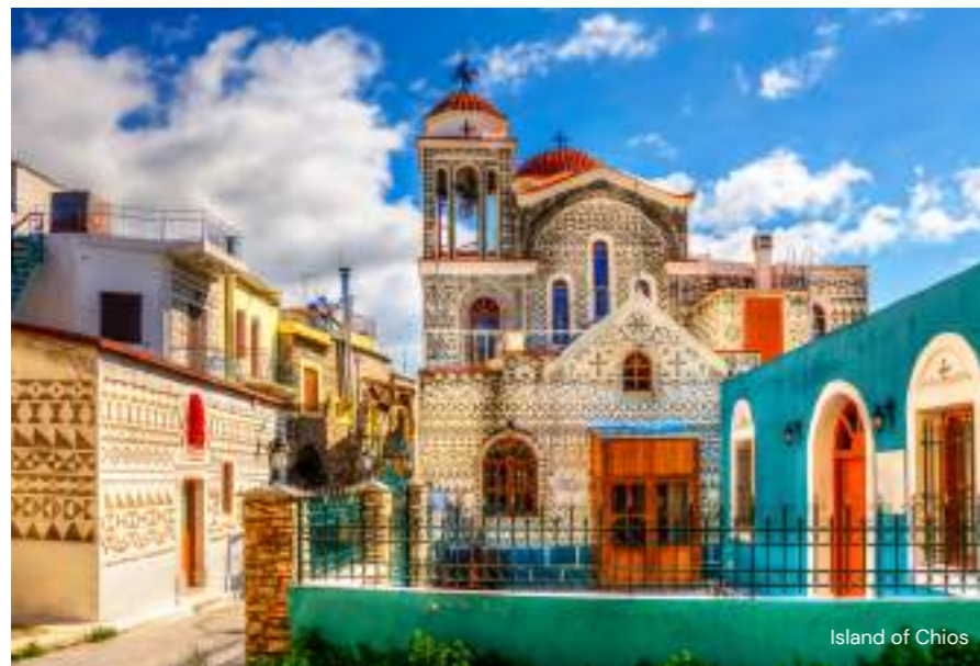
Island of Chios