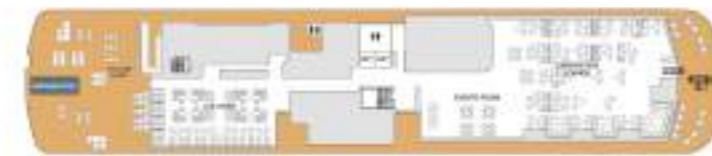
Deck 7 Swimming Pool Pool Bar & Grill Club Lounge Events Room Observation Lounge