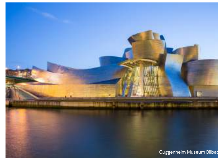
Guggenheim Museum Bilbao