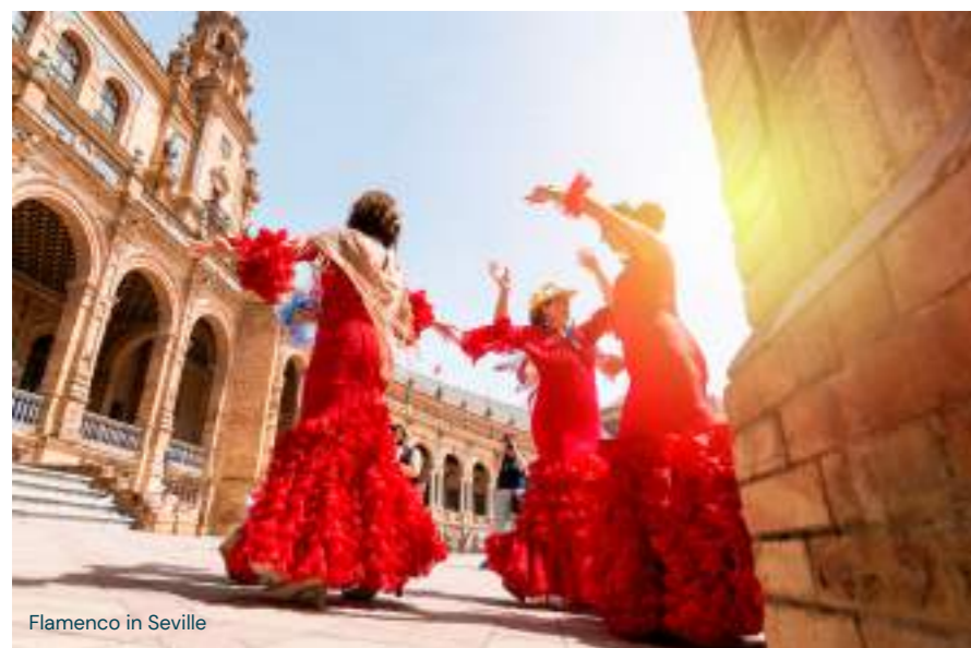
Flamenco in Seville