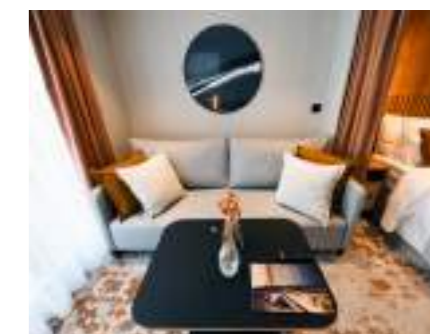
Oceanview 19m 2 (205ft 2 ) | Sleeps 2

Balcony staterooms feature two single beds or a double bed bedroom with living room area, a luxurious bathroom and your own private 6m 2 (65ft 2 ) balcony.