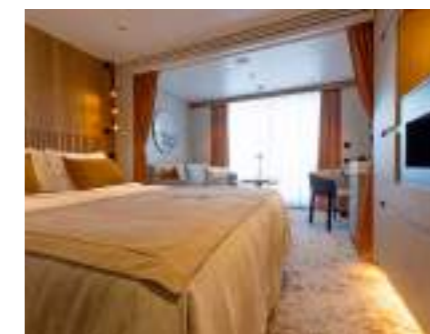
Balcony 28m 2 (302ft 2 ) | Sleeps 2/3

Features a king size bed, separate living room area with homely flame-effect fireplace, private kitchen, luxurious en-suite bathroom and a 7 sq. m private balcony.