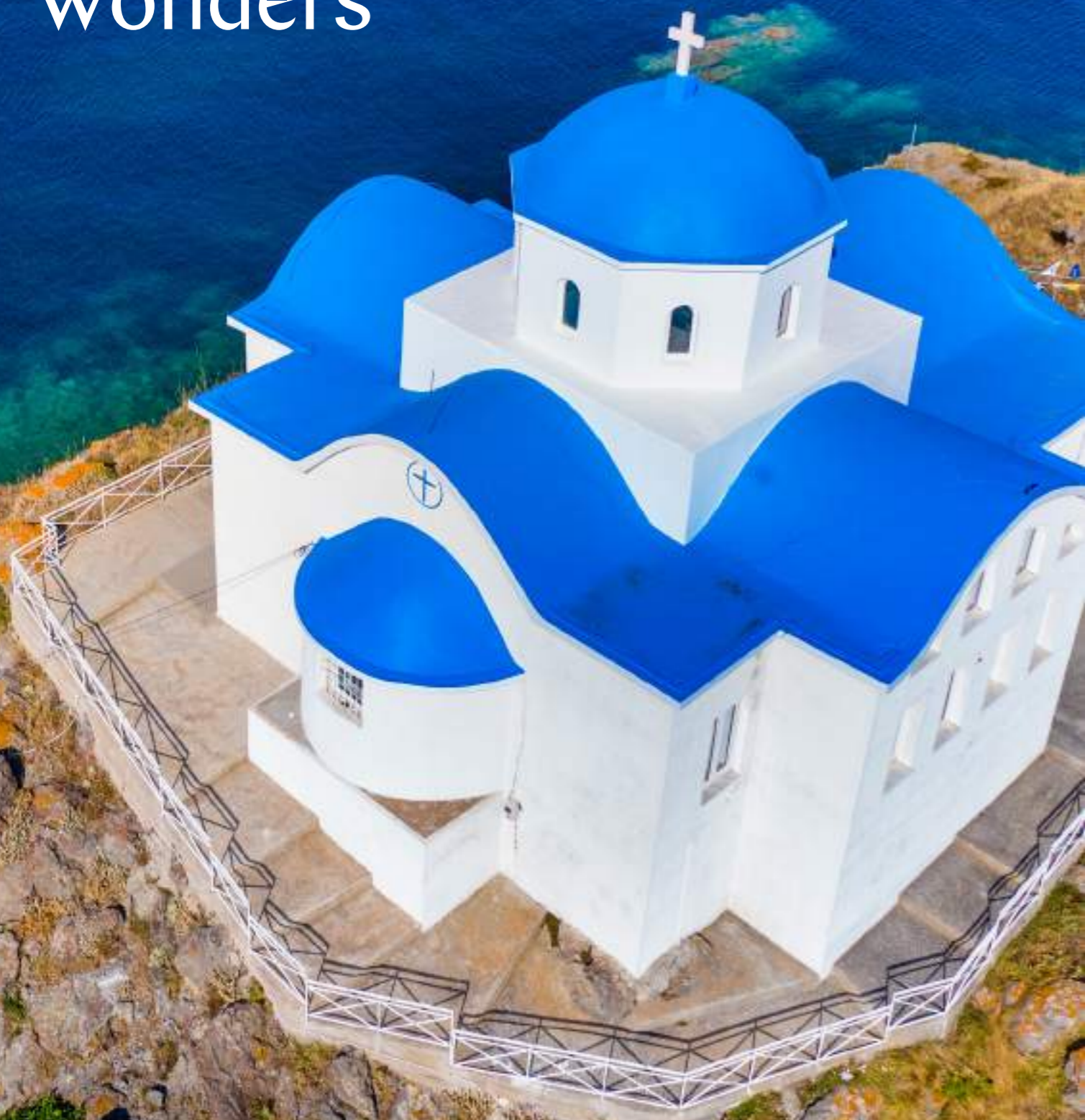
Church of Agios Nikolaos, Island of Lemnos, Greece