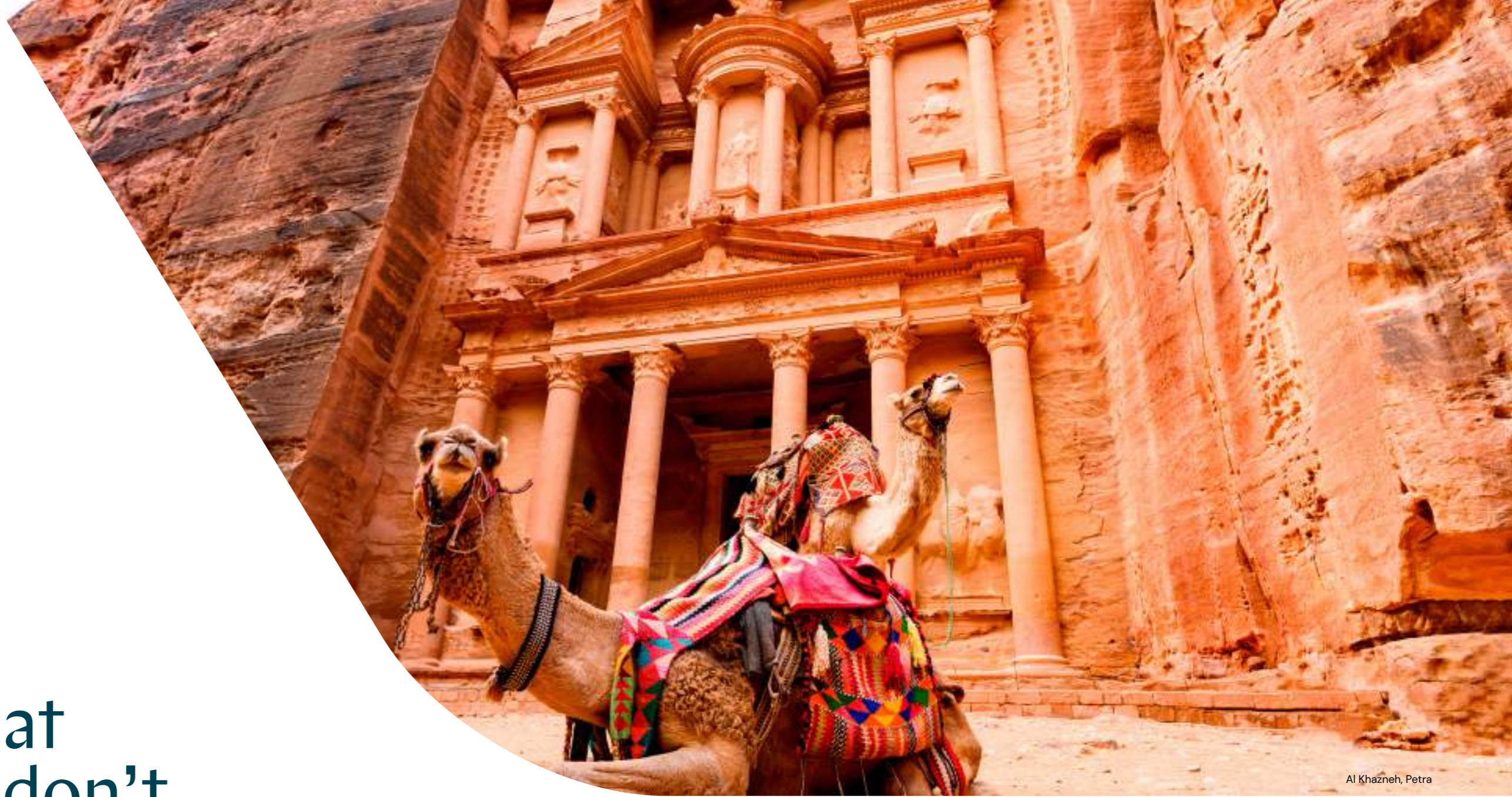
Al Khazneh, Petra

Some people see things as they are, others look further. Let us take you on a journey, that will change the way you see the world. Sail to some of the most incredible, remote destinations on the planet. When you travel with us, the wonders of the world take on a richer hue.