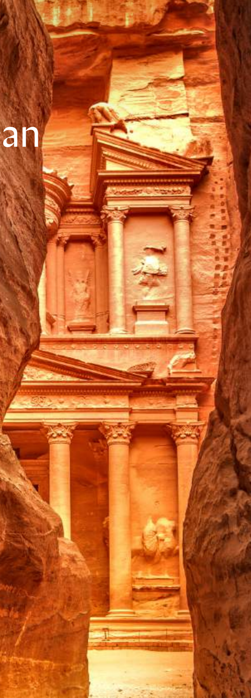
Al Khazneh, Petra