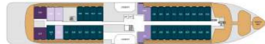
Deck 6 Premium Suites Suites Junior Suites Balcony Staterooms Swan's Nest