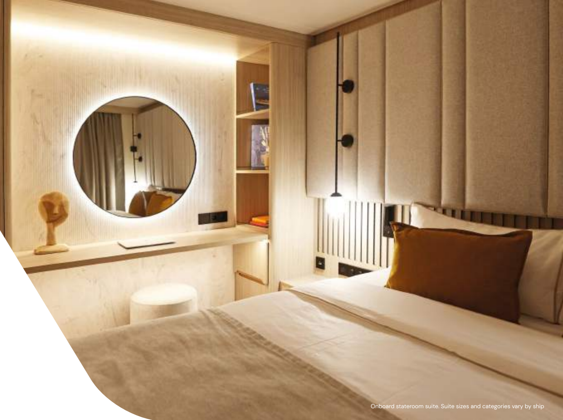
Onboard stateroom suite. Suite sizes and categories vary by ship

Each of our beautifully designed staterooms has everything you need for a pampered stay. Fluffy dressing gowns, a spacious dressing area and ample seating, as well as a well-stocked minibar and a personal safe. The desk in your room is the perfect place to plan the next day's adventures, or head to your ensuite for a hot rainfall shower - the ideal way to relax after an action-packed day.