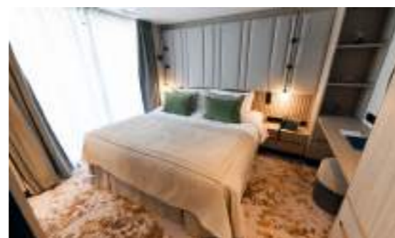
Suite 44m 2 (474ft 2 ) | Sleeps 4

Premium suites feature a king size bed and separate living room with a soothing, flame-effect fireplace, a luxurious ensuite bathroom with separate bath tub and walk-in shower, a spacious walk-in wardrobe and a 12m 2 (129ft 2 ) private balcony.