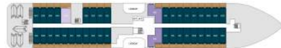
Deck 5 Balcony Staterooms Junior Suites Suites