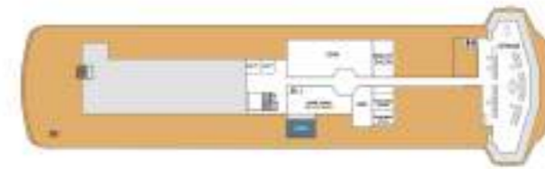
Deck 8 Gym Sauna Jacuzzi Spa Beauty Salon Bridge