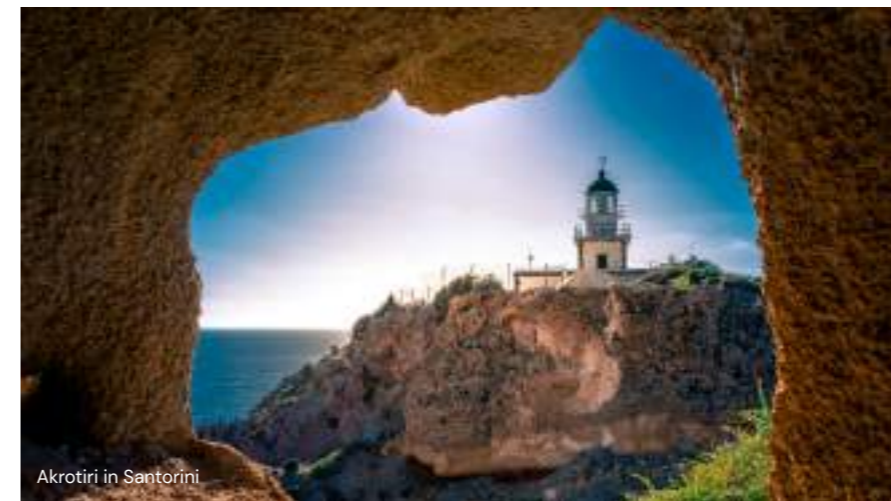
Akrotiri in Santorini

📅 12 – 23 Sept 2023 📍 Piraeus – Istanbul 📅 12 days 🏠 SH Diana