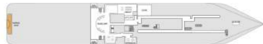
Deck 3 Marina Deck Zodiac Boarding Basecamp Library Expedition Lab Clinic Laundry