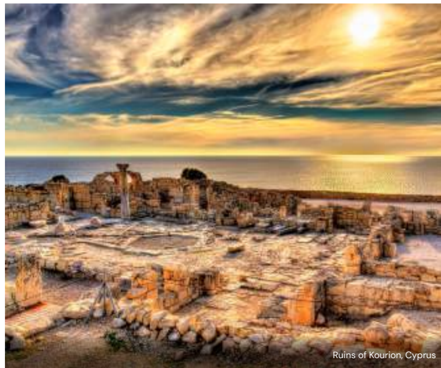
Ruins of Kourion, Cyprus